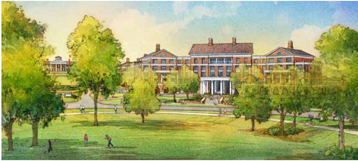
The architecture of the new Darden lifelong learning and meeting center will blend with adjacent buildings on North Grounds.